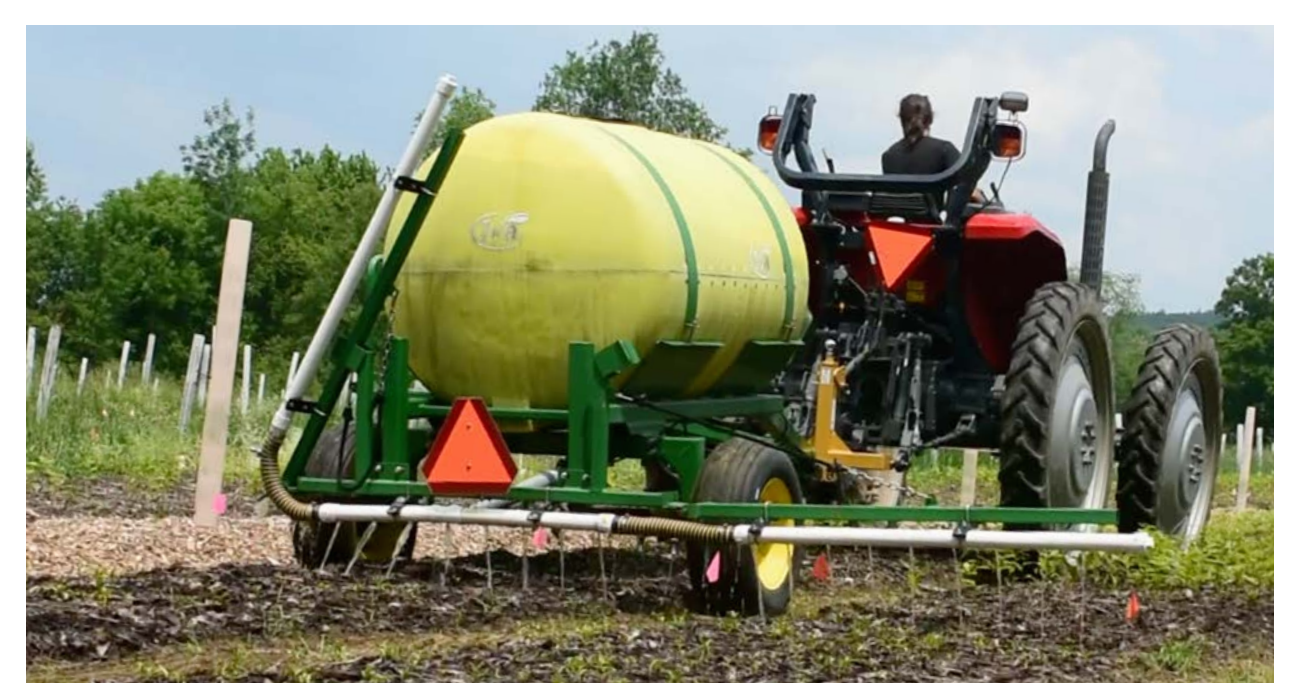
Figure 13. Rich Earth's custom field applicator applies urine fertilizer to nursery stock.

In a controlled experiment, Bitternut Hickory nursery stock grown in air-pruned beds had larger stem and root diameters when urine was applied at 0.03 gallons/square foot than non-fertilized controls, yet these growth effects were not seen when urine was applied at half this rate. There were no differences in stem height or mass between urine-fertilized plants and non-fertilized plants.