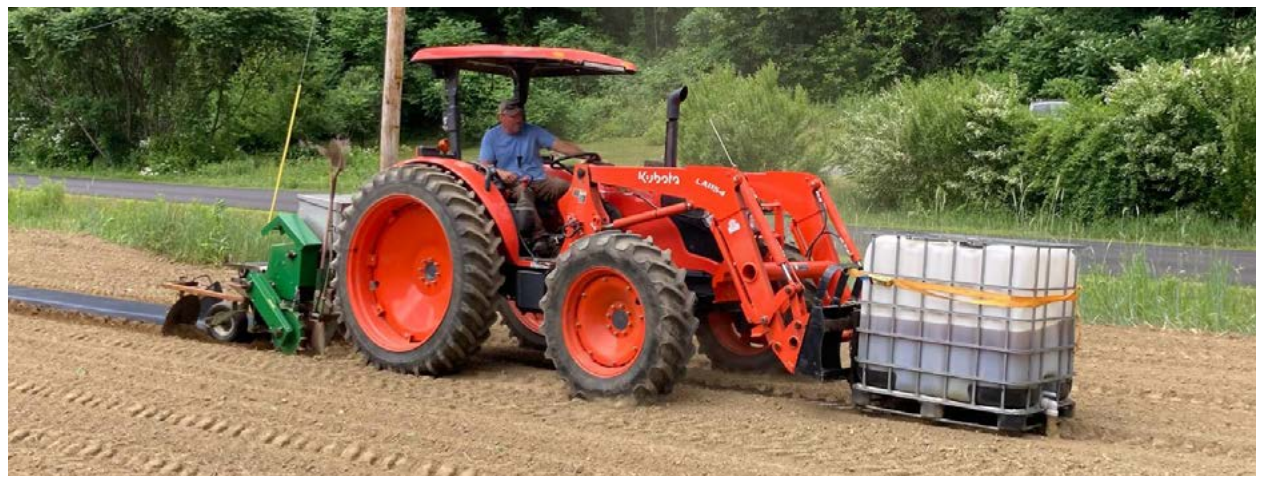
Figure 6. A tractor carries an IBC tote of urine fertilizer on forks while pulling a plastic layer from the rear