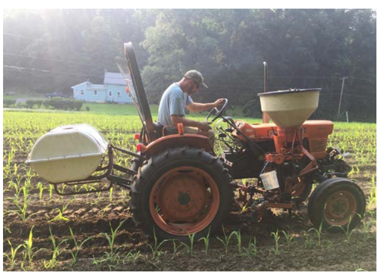
Figure 5: A modified tractor with a tank attached to a 3-point hitch applies urine while cultivating corn rows at Pete's Stand.