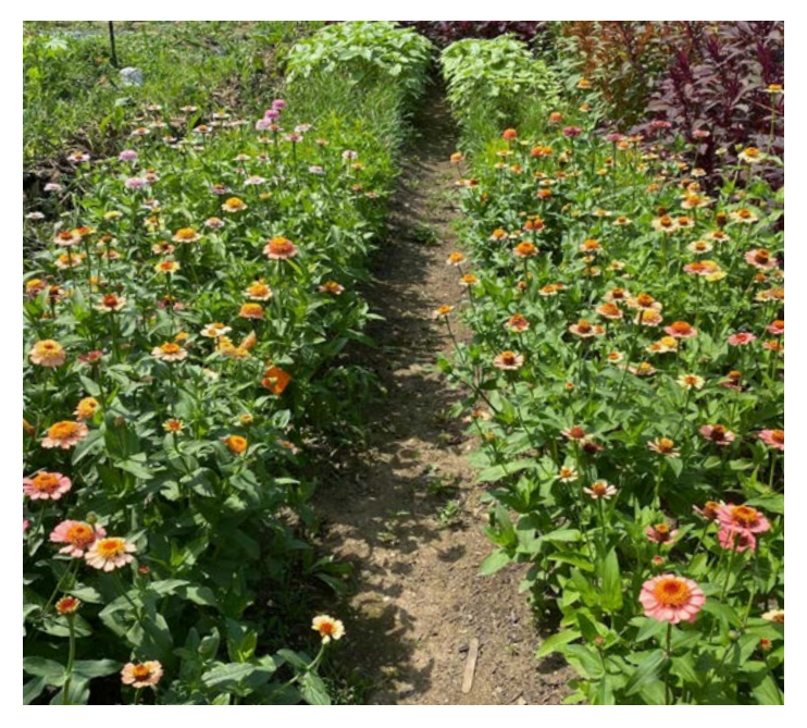
Figure 11. Zinnias: Urine treated on right

At Tapalou Guilds Flower Farm, Hanna Jenkins hand-applied urine to a bed of cut flowers alongside an unfertilized bed of the same varieties of cut flowers to do a side-by-side comparison. Both beds also received their usual treatment of compost tea. Jenkins observed no major differences between the urine treated crops and those fertilized with her usual treatment, but some of the urine treated celosia, amaranth and sunflowers appeared taller, on average, than her controls. She was unable to quantify any differences in numbers of blooms (as she was pinching and pruning the plants throughout the season) but felt there were no negative outcomes. She had no significant disease or pest pressure on either the urine treated or control crops. The foliage on