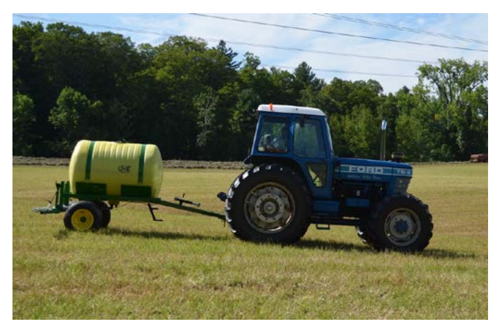
Figure 3: Side view of the Rich Earth applicator applying urine on a hay field.