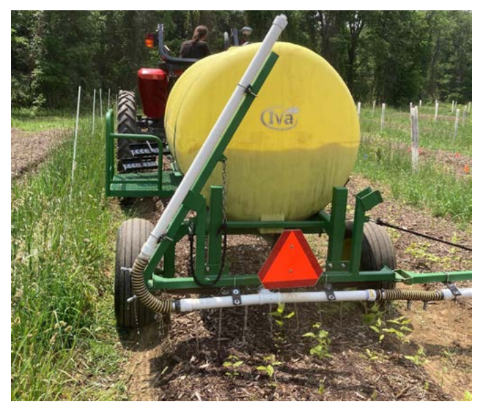
Figure 4: The Rich Earth applicator with one boom retracted, delivering urine to a bed of nurserytrees at Yellowbud Farm.