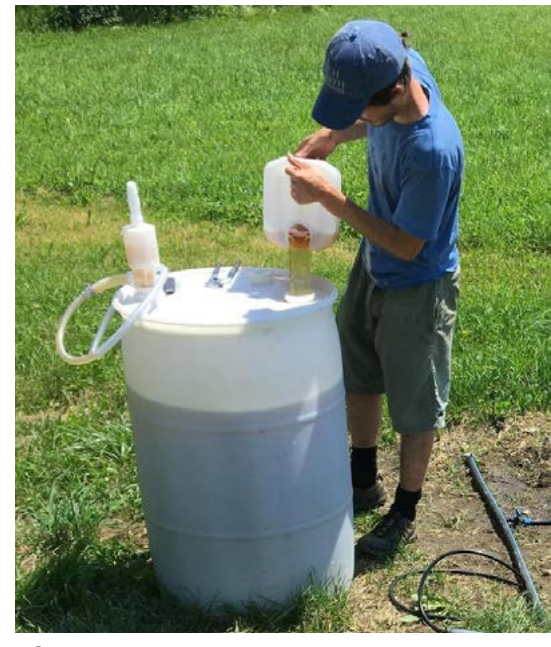
Figure 7. An on-farm fertigation system using urine fertilizer.