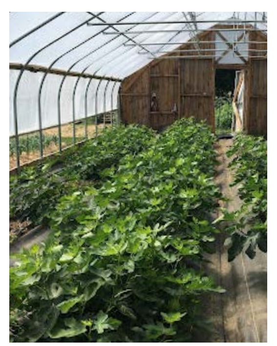
Figure 12. Fig saplings in a hoop house.

At Rebop Farm , four treatments (urine, urine + compost, compost alone, control) were applied in June to figs grown in a greenhouse. Ashlyn Bristle was enthusiastic about the results she observed through August of the trial year. She described the urine-treated sections as having "the heaviest fruit-set" and best growth overall, and added "it's spectacular, fruit all the way down," and the crop was branching abundantly, providing opportunity for more fruit development. She felt that the best results at that point were being seen in a urine + compost treatment, where she estimated three to four times the usual fruit set. The next best fruit-set was in a urine only treatment, then manure only, then the control. Unfortunately, at the end of the season Bristle reported failure to ripen in all but one fig variety. This problem occurred across all treatments, and was not attributed to urine fertilizer. She believed that the problem was the excessive rain the region experienced that season, which led to "wet feet" in the soil even within the greenhouse (located on a hillside), which is not optimal for figs. In the future, she would move her application timing up to early May,